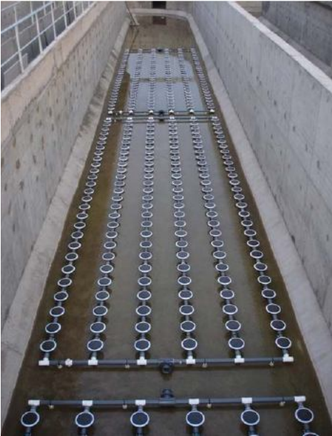
aeration nozzles in sewage canal