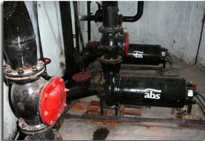
Part of modernized pump station