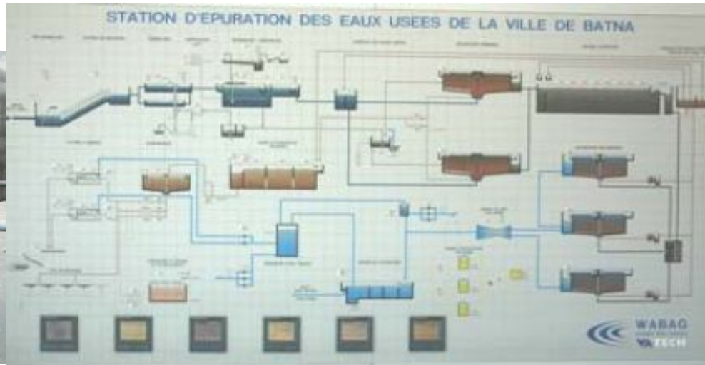
Process visualization on HMI