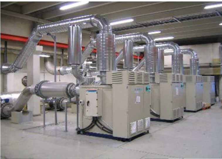
Highly modernized central station