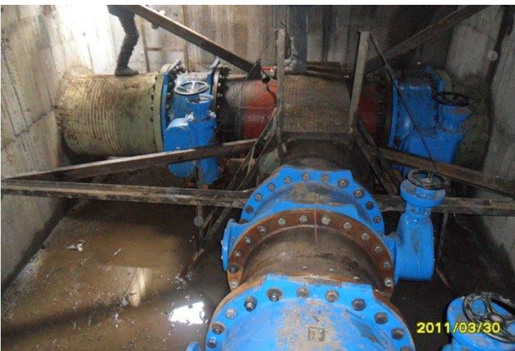
Manually adjustable flow control valves, above and under