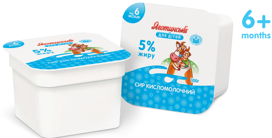
Cottage cheese, 5% fat Plastic cup, 100g

The product is intended as complementary food for children aged 6 months and up.